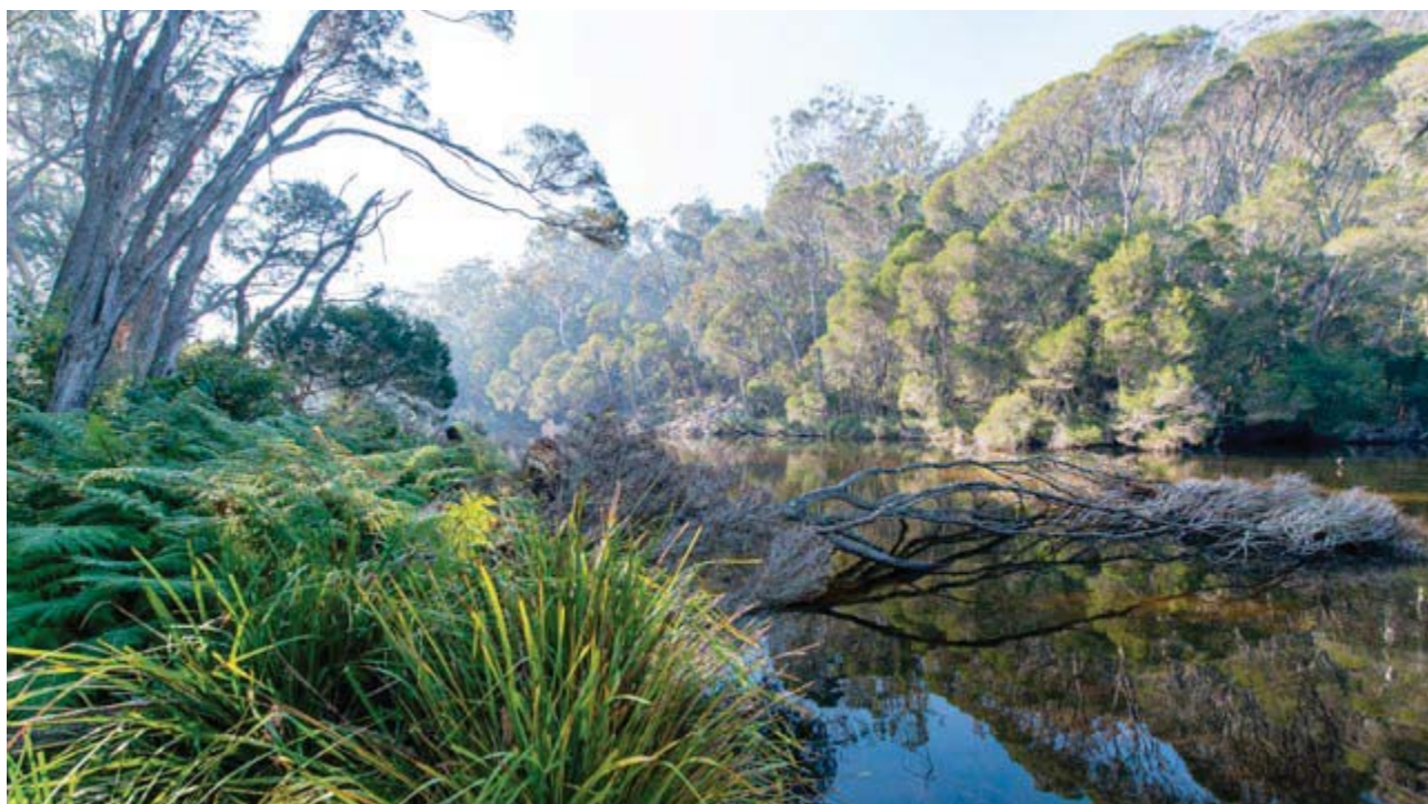
Photography: Sandy Creek Loop Track Bournda National Park (John Spencer/OEH)