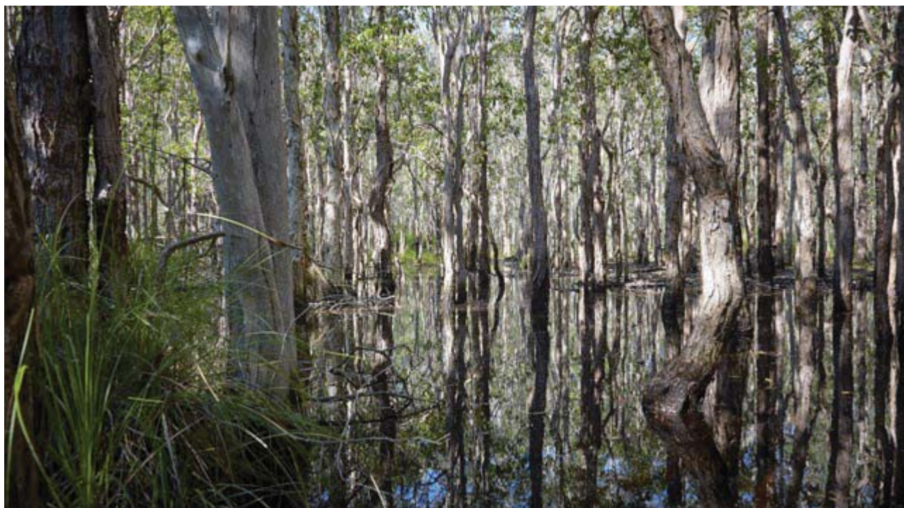
Iluka Nature Reserve